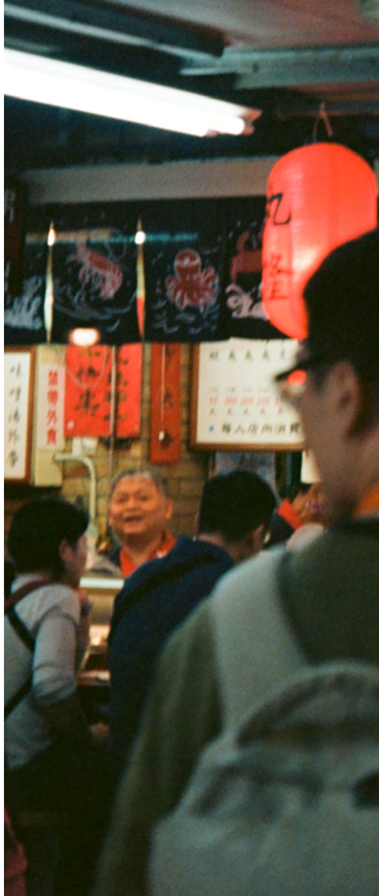
▲ According to a Walk In Taiwan staff member, this stall is the best amongst those of the indoor market.

To get to Dadaocheng, the university students boarded one bus, while the high school students boarded another. This was surprising to some international students. They were expecting to be paired with local students right away, so that they could spend the journey getting to know each other. Instead, NCCU students were given the opportunity to mingle and meet new faces. Among them, a few Taiwanese students who had also decided to join the activity got to engage in conversation with students from abroad. The whole bus ride was thus still an occasion for cultural exchange.