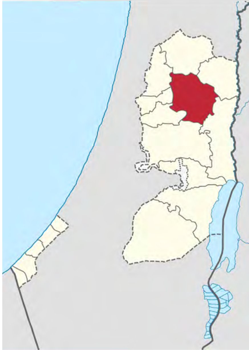
▲ Location of Nablus, Palestine