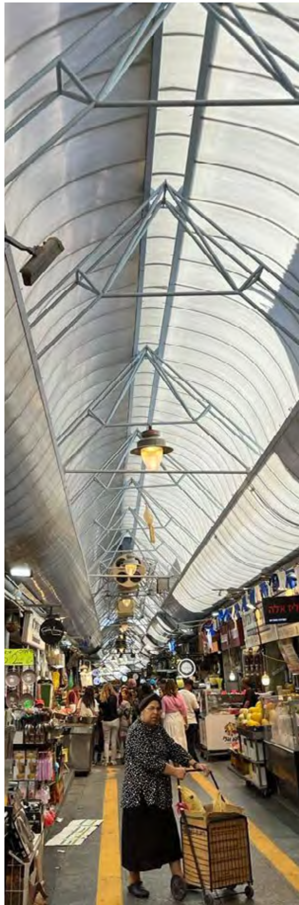
▲ Views of Israel.

This brief synopsis is an oversimplification of the conflict and I implore you to do additional research to gather a deeper insight. The following is one perspective on the conflict from a past National Chengchi University student, who has recently returned to Israel. This article is part one of a two-part series. In part one, an Israeli perspective is represented. In part two, a Muslim perspective is represented.