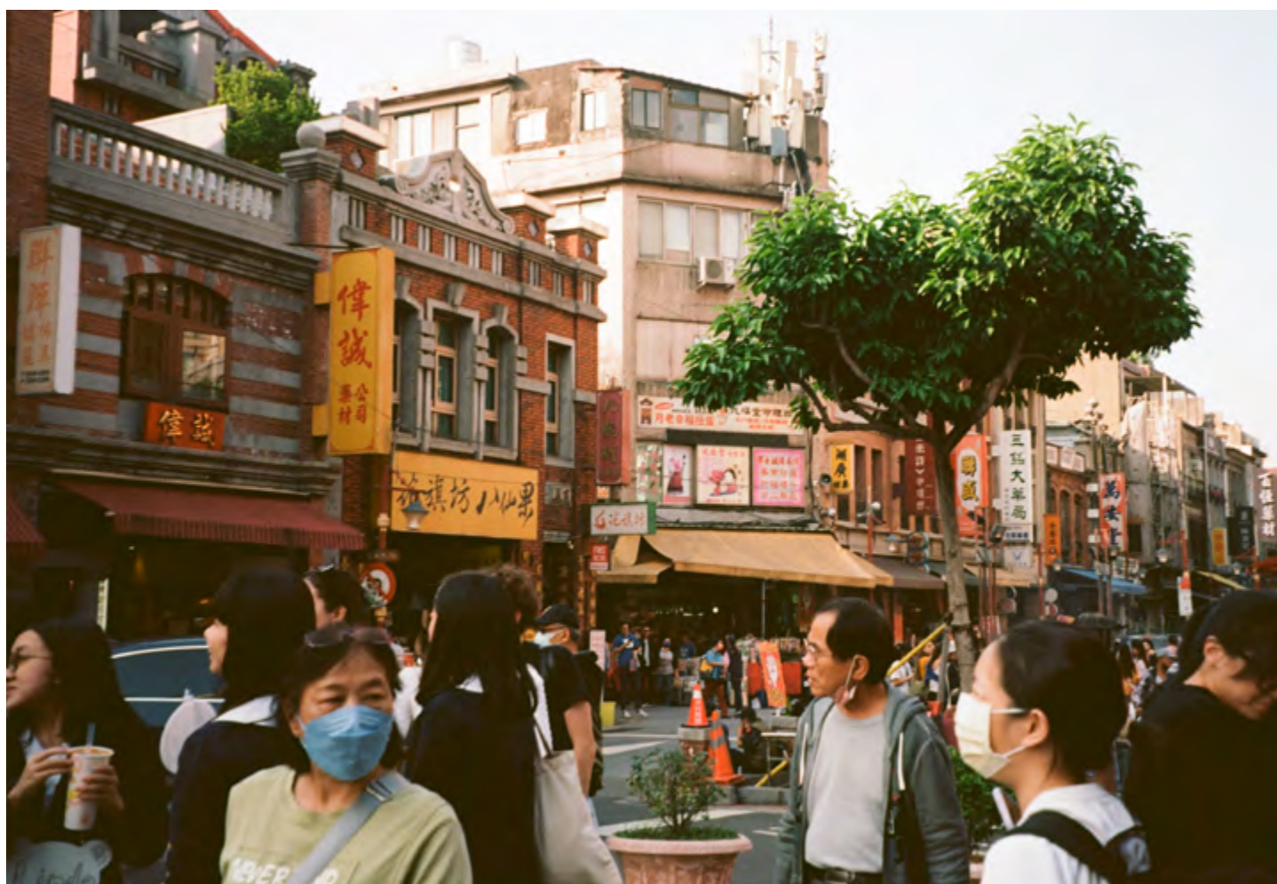
A NCCU USR staff member, Chao Yu, pointed out that Dadaocheng's architecture and atmosphere were perfectly suited to be captured using film photography.