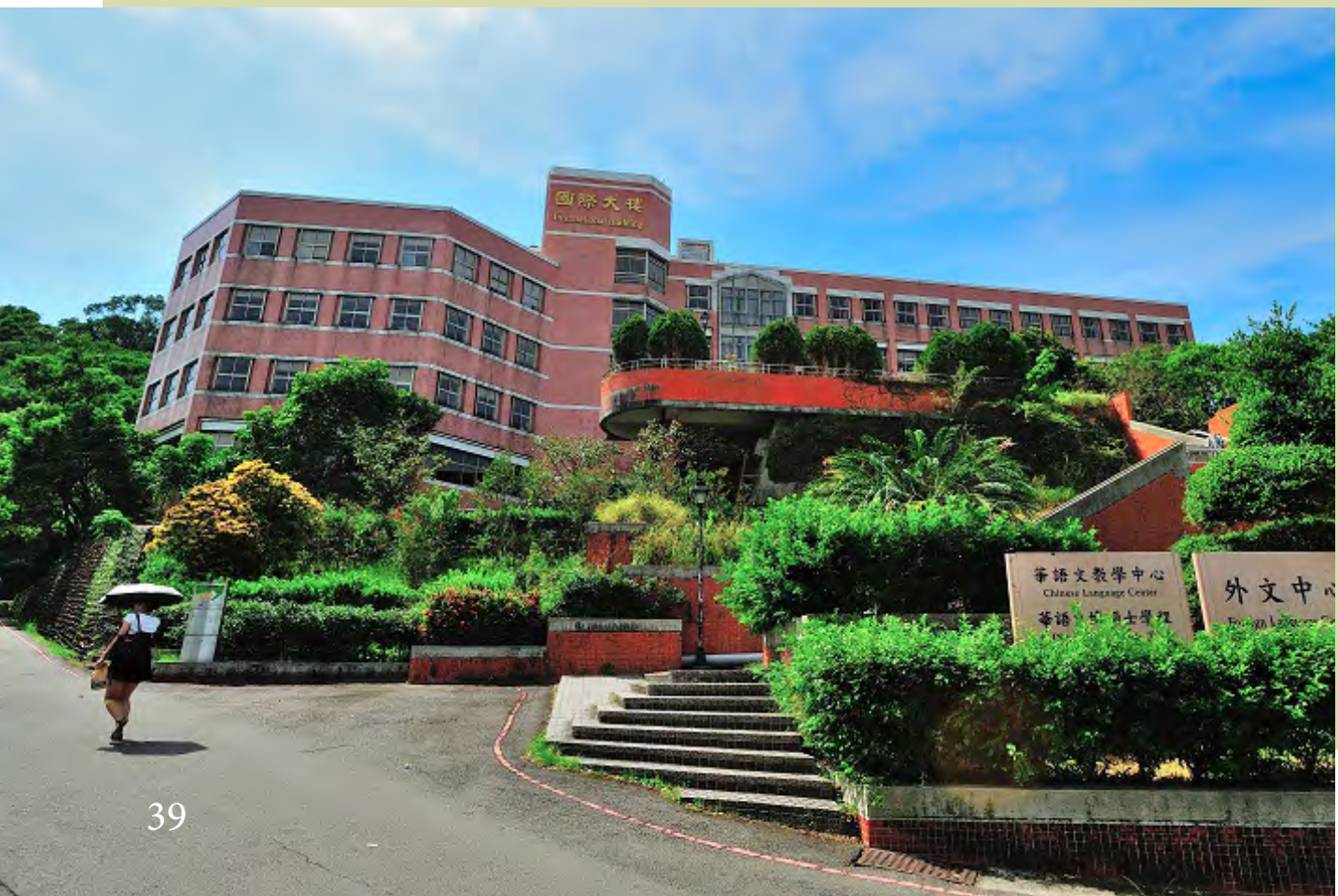
▼ International building

“I came to NCCU because of the program, I want to be a diplomat in the future” – 2nd year Department of Diplomacy student