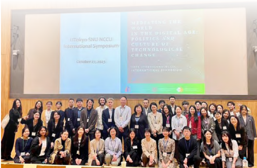
▲ Group photo capturing the conclusion of the symposium, featuring international students from various universities around the world.

Ondrej and Yulgong also highlighted the symposium’s role in fostering a collaborative and intellectually stimulating environment. The event was not just a platform for them to present their research, but also a valuable opportunity for networking, sharing diverse perspectives, and learning from the experiences of their peers and established scholars. They both agreed that such interactions were crucial in broadening their academic horizons and enhancing their research methodologies.