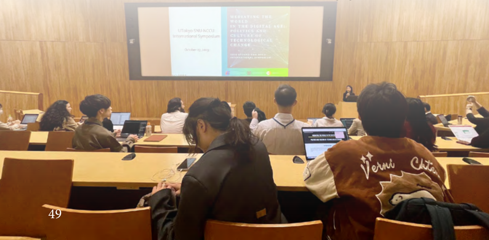
Overview of the symposium’s main room.

The IMICS program at NCCU carefully selected six outstanding students from Korea, the Czech Republic, and Taiwan to present their groundbreaking research. These students were chosen through a thorough review process and had the opportunity to suggest topics that aligned with the central theme. Highlighted paper proposals include: