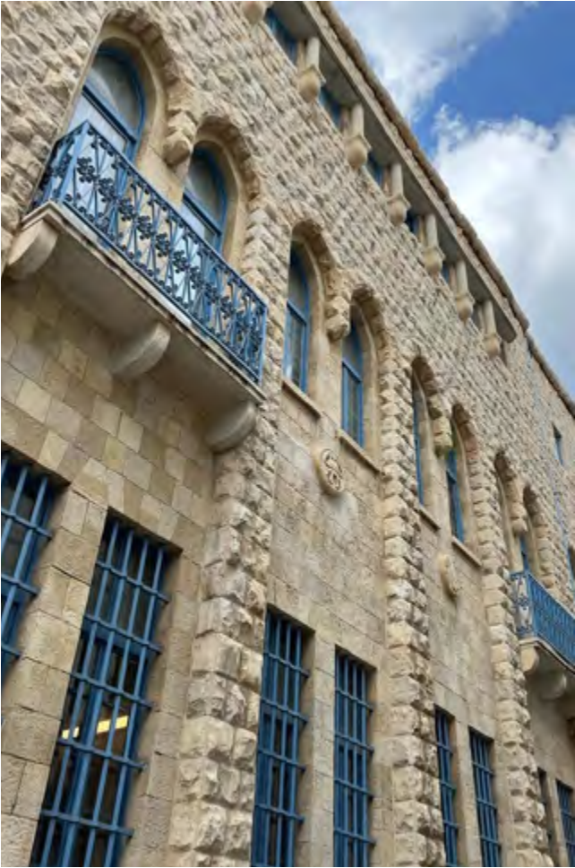
Views of Israel.