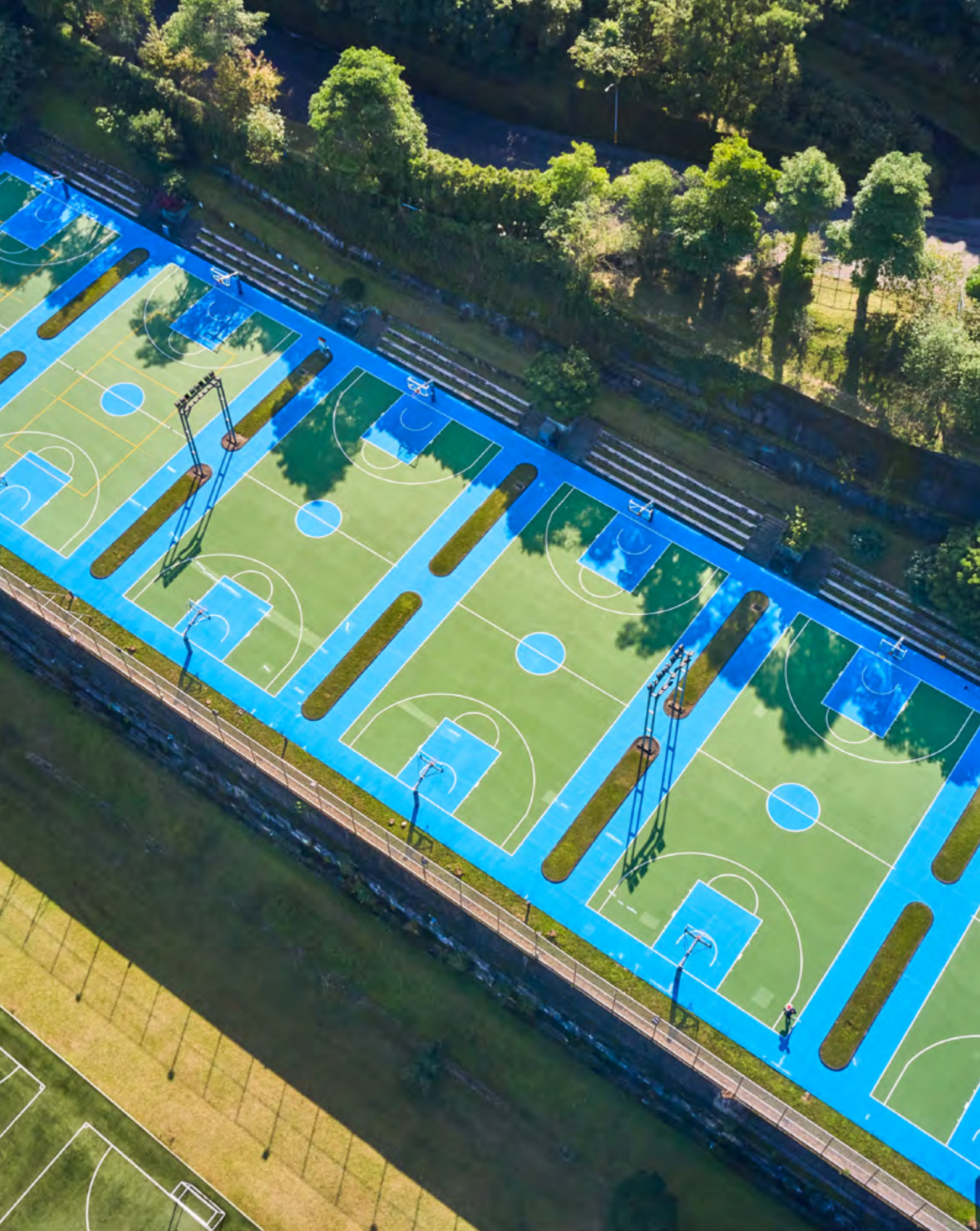
▲ NCCU's exercise yard