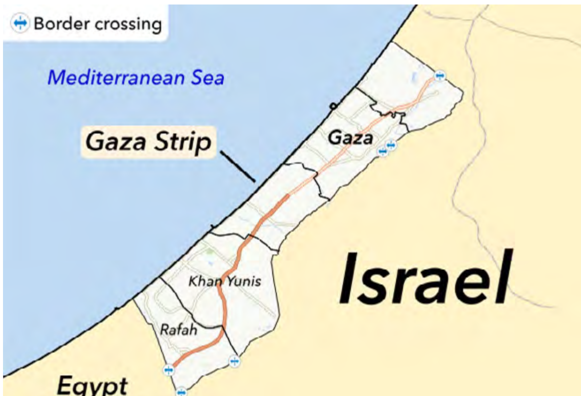
▲ Map of the Gaza Strip.

The following is one perspective on the 2023 Israel-Hamas conflict from a Palestinian-Taiwanese student. This article is part two of a two-part series. In part one, an Israeli perspective is represented. In part two, a Muslim perspective is represented.