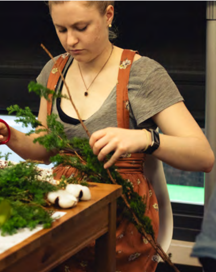
with other international students making Christmas wreath

arrangements, FulownA distinguishes itself by extending its expertise to those eager to delve into the art form through educational courses. This commitment to education makes FulownA an ideal collaborator for an event designed to bring joy and skill to the international student community.