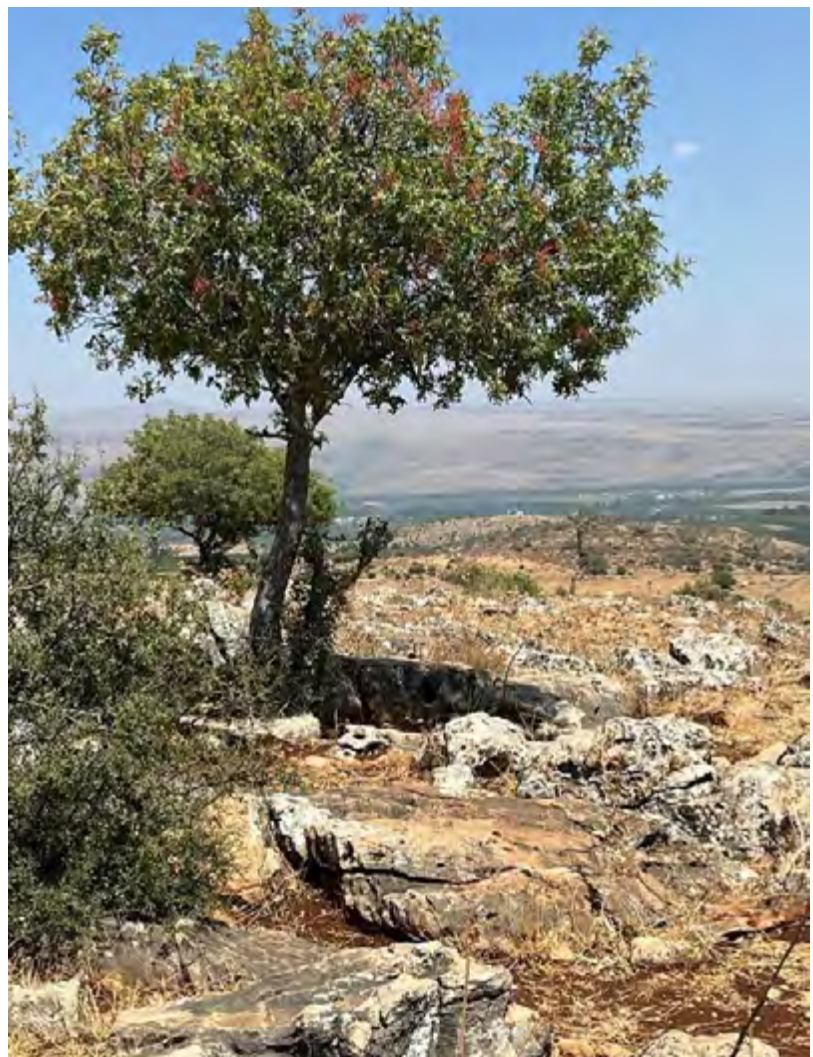
Views of Israel.