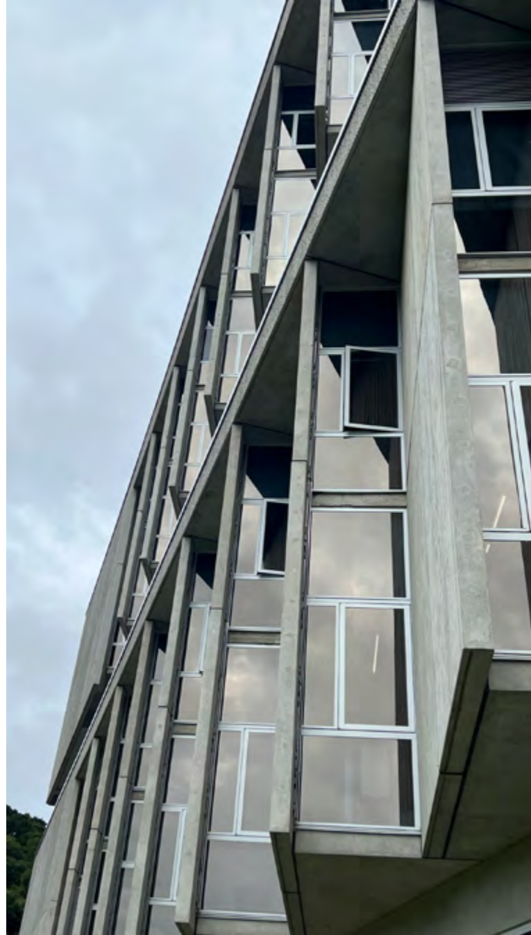
▲ Dah Hsian Seetoo Library

“Actually, I was trying to choose between NCCU and a school in Europe, I was prepared to go to Europe and even paid a deposit, but then got the acceptance to NCCU and changed my plans. I wanted to be in Taiwan after visiting and falling in love with the country and everything is much cheaper than Europe. Not only that, but the scholarship options are good in Taiwan. I had looked at other programs in Taiwan, but they didn’t have anything I was interested in, which was why I picked NCCU.” – 2nd year International Master’s Program in International Studies student