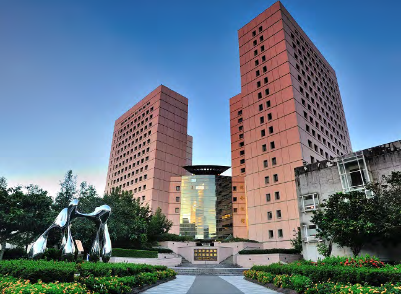
▲ General building of colleges

“There were a few schools I was looking at, but this was the only one in Taipei, so I decided to come here.” – 2nd year International Master’s Student in Asia-Pacific Studies (IMAS)