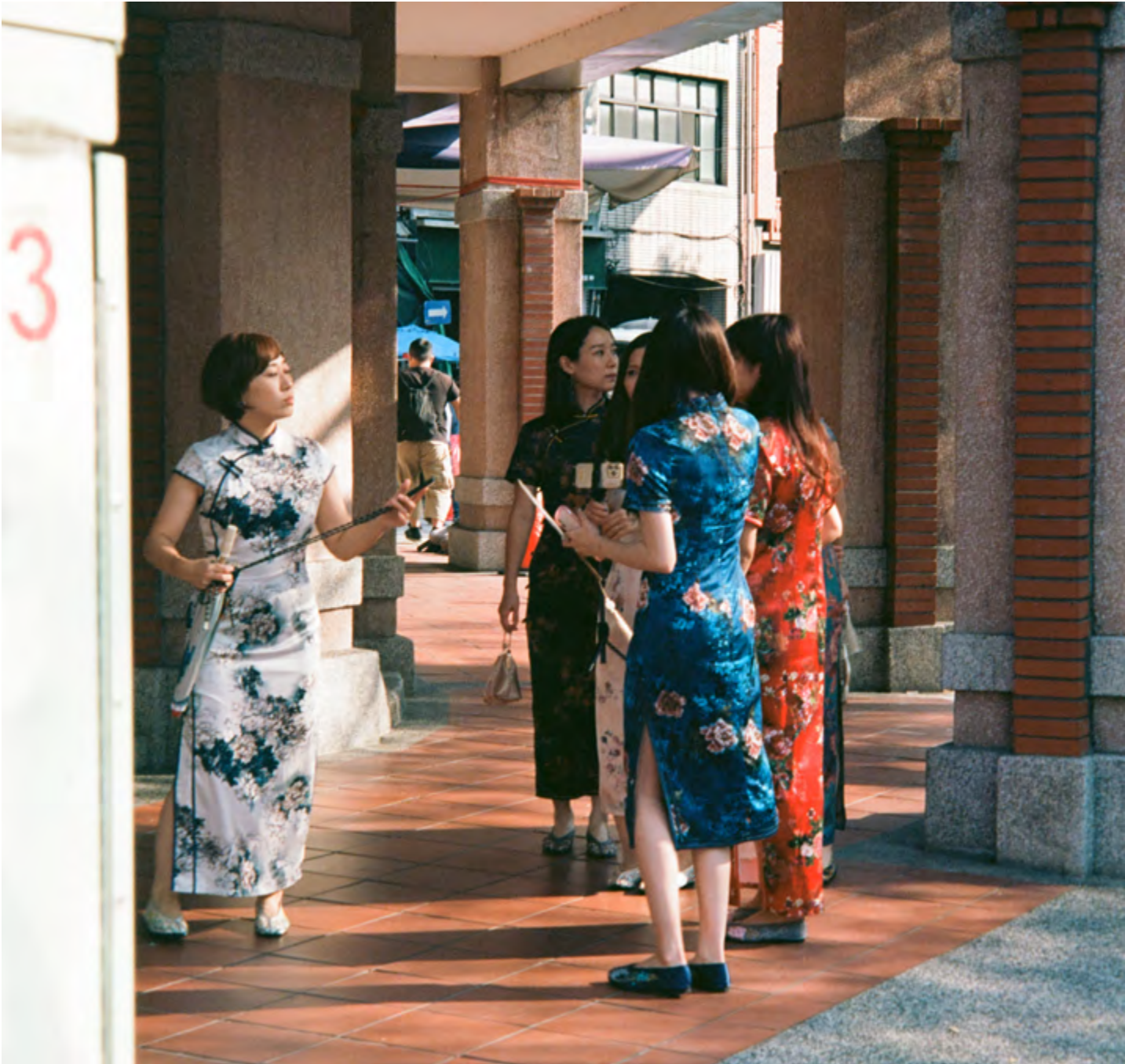
▲ It is customary for female tourists and visitors to rent a qipao - a Chinese traditional dress - to wear while wandering the streets and taking pictures.