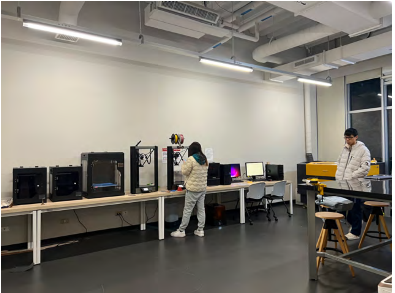
▼ 3D printers in makers space